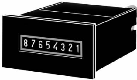
Standard Clip Mounting